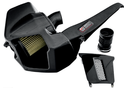
SKU: 2660-15032 AIRGATE™ CARBON INTAKE

The S-FLO Carbon Intake System is a complete replacement for the factory airbox that breaks the mold to offer a convertible design, unlocking intoxicating turbo spool as well as proven power gains delivered at the wheels.