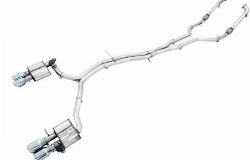
SWITCHPATH™ EDITION Two soundtracks, one package. Retains factory valve behavior or control via remote.