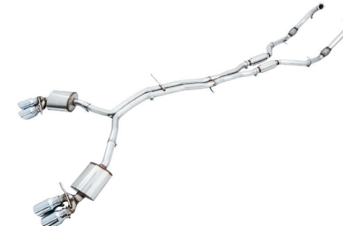
TOURING EDITION Smooth tone with no drone throughout the entire range, thanks to 180 Technology®.