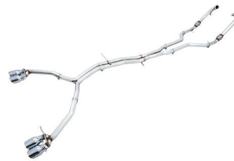
TRACK EDITION The Track Edition provides the most cost-effective aggression in the lineup.

Perfect fitment, patented drone-canceling 180 Technology®, aggressive tip options, and a soundtrack only AWE can deliver, proudly engineered, designed, and manufactured in-house, in the USA. Presenting the Best Sounding Exhausts on the Planet™ for the Audi B9 S4 & S5 Coupe/Sportback.