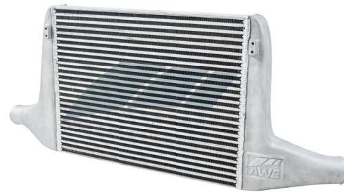
SKU: 4510-11060 COLDFRONT™ INTERCOOLER

Cast aluminum end tanks with internal baffling and a robust bar/plate aluminum core for maximum heat transfer render a 130% increase in frontal surface area and a massive 83% increase in volume over the factory B9 intercooler. No gimmicks, just results.