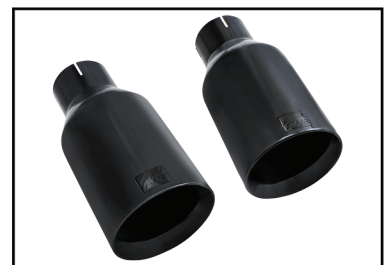
Signature AWE 5" double-walled exhaust tips in a diamond black finish.