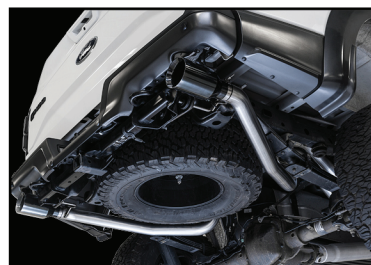
Dual 3" tail pipes topped with 5" individually adjustable tips finish off the rear of the Raptor.