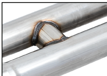
AWE's precision-engineered H-pipe unlocks a deep, aggressive, drone-free tone.