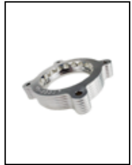
Throttle Body Spacer