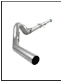
Cat Back Exhaust