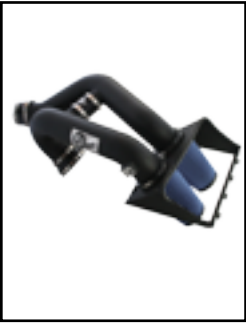
Air Intake System