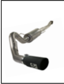
Cat Back Exhaust