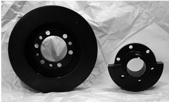
Damper Ring (A)

BALANCING OR MATCH BALANCING -Fluidamprs designed for externally balanced engines include the damper ring (A) bolted to a counter-weighted hub (B). See photo below.