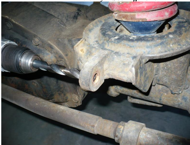
Figure 2. Drilling Out Lower Mount to 1/2"