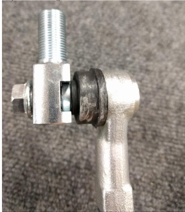
Figure 3. Properly Assembled Sway Bar End Link