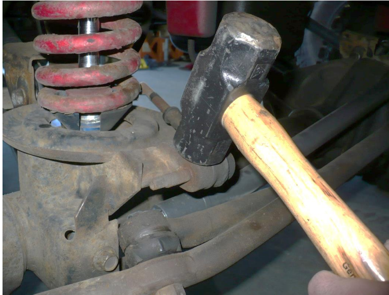
Figure 1. Using Hammer to Release Taper Fit