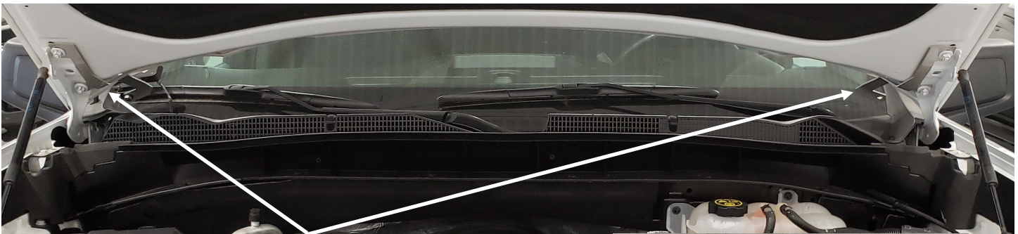
Figure 1a: Bracket Locations

The brackets are designed to utilize the factory mounting locations for the hood hinge. These locations are shown in Figure 1a .