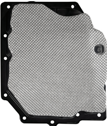
PART # 10377 '07 - '11 JEEP WRANGLER JK W/ VLP 42RLE TRANSMISSION