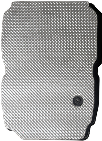
PART # 10376 '12 - '18 JEEP WRANGLER JK W/ W5A580 TRANSMISSION