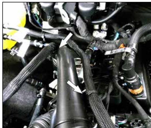
2. Disconnect the coolant hoses from the hot-side charge tube.

NOTE: Disconnecting the negative battery cable erases pre-programmed electronic memories. Write down all memory settings before disconnecting the negative battery cable. Some radios will require an anti-theft code to be entered after the battery is reconnected. The anti-theft code is typically supplied with your owner's manual. In the event your vehicles anti-theft code cannot be recovered, contact an authorized dealership to obtain your vehicles anti-theft code.