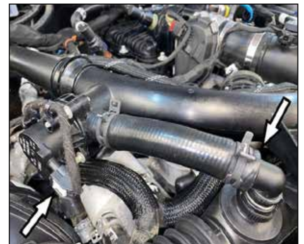
3. Release the BOV hose quick connect fitting and disconnect the BOV hose from the intake tube. Then disconnect BOV electrical connection and unhook the wiring harness from the mounting post.