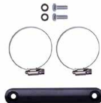
Frame Mount Clamp B4-KT2-Z009A00