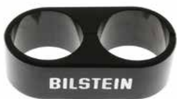
Billet Piggyback Mounting Clamp 11-176015