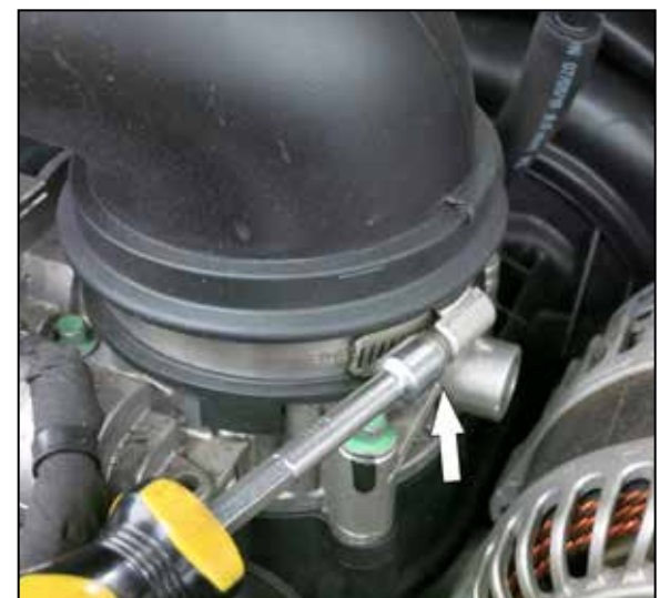
3. Loosen the hose clamp that secures the factory intake tube to the throttle body and then disconnect the intake tube from the throttle body.