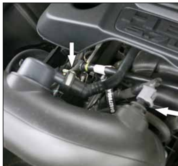
2. Disconnect the crankcase vent line quick disconnect fitting.

1. Turn off the ignition and disconnect the negative battery cable. NOTE: Disconnecting the negative battery cable erases pre-programmed electronic memories. Write down all memory settings before disconnecting the negative battery cable. Some radios will require an anti-theft code to be entered after the battery is reconnected. The anti-theft code is typically supplied with your owner's manual. In the event your vehicles anti-theft code cannot be recovered, contact an authorized dealership to obtain your vehicles anti-theft code.