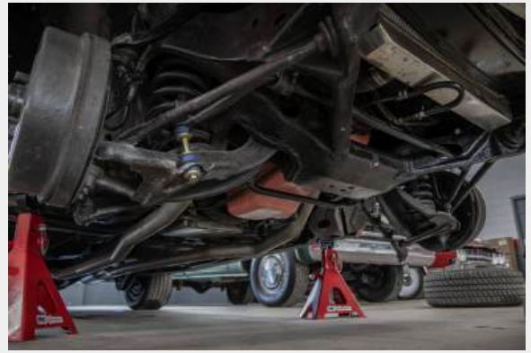
Figure 1: Disconnect Factory Sway Bar