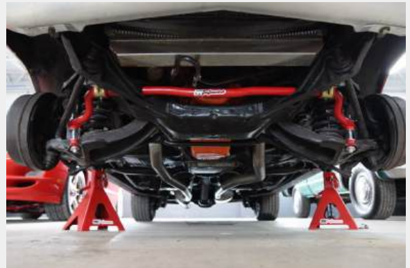
Figure: Finish Installed Sway Bar