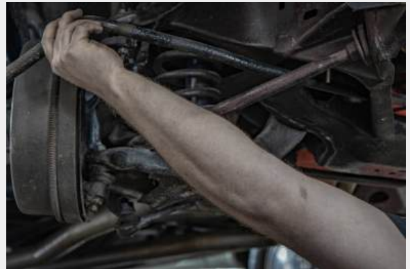
Figure 2: Sway Bar Removal