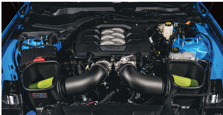
The AWE S-FLO Carbon Intake is a direct replacement for the factory intake, providing +15 hp & +15 lb-ft of torque at the wheels on stock software. Bolt-on and go.