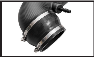
The carbon tubes feature oversized 4.25" outlets for throttle body upgrades.