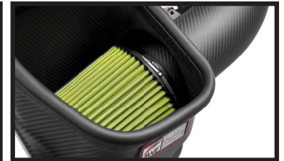
The carbon boxes create a tight seal to the hood when closed.