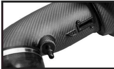
Factory mounting locations for MAF and vacuum are kept in place.