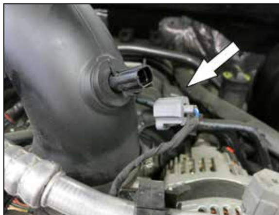
2. Disconnect the IAT sensor electrical connection.

NOTE: Disconnecting the negative battery cable erases pre-programmed electronic memories. Write down all memory settings before disconnecting the negative battery cable. Some radios will require an anti-theft code to be entered after the battery is reconnected. The anti-theft code is typically supplied with your owner's manual. In the event your vehicles anti-theft code cannot be recovered, contact an authorized dealership to obtain your vehicles anti-theft code.