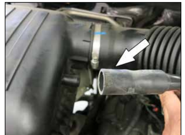
3. Disconnect the CCV hose from the upper air filter housing.